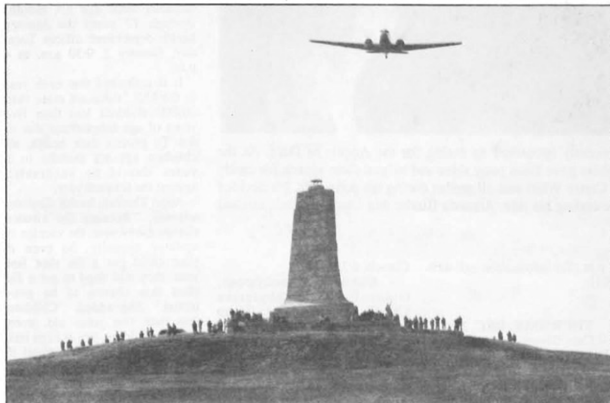
AN AIR SHOW, including flybys by an assortment of various aircraft, was the culminating tribute to Orville and Wilbur Wright at the 103rd first flight anniversary celebration at Wright Brothers National Memorial, this past Sunday, December 17, in Kill Devil Hills.