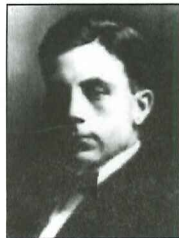
Tony Jannus, 1914