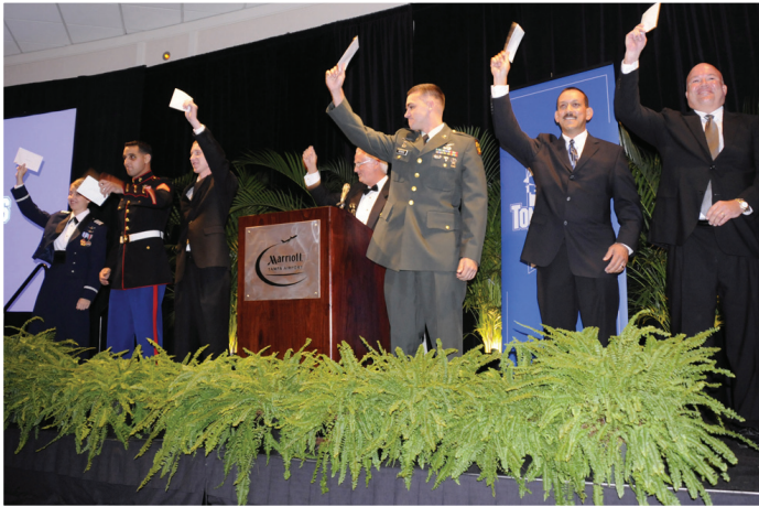
Tony Jannus Scholars Awards winners celebrate their achievements